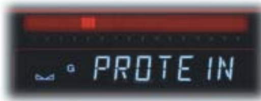
Setpoint naming feature provides operator with instant, error-free process information.

The universal Remote I/O link or Profibus options offer sophisticated control of your weight process, while providing localized control of the individual weighing workstation.