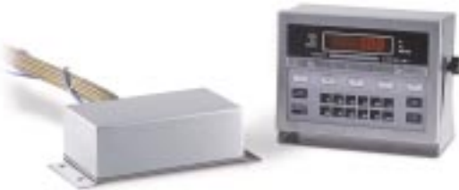
The IQ 700 IS shown with intrinsically-safe power supply.

In dangerously-explosive and dimly-lit environments, the FM-approved intrinsically-safe IQ 700 IS shines as the new indicator of choice. From the